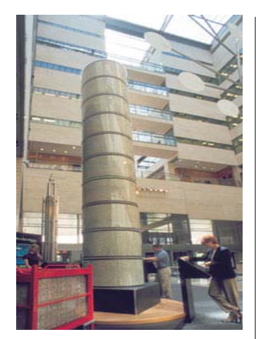
Out of curiosity: Lobby of the Federal Reserve Bank of Philadelphia. The lobby features a 25 foot (7.6 m) tall tower filled with shredded U.S. currency.