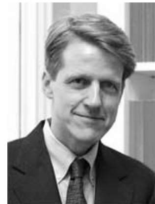
Professor Robert Shiller

"Well, actually, I am not calling it a bubble, but I think a lot of commodities are moving according to a thesis that can lead or that has led to a bubble. The thesis is both magnetic and straightforward: the demand emerging from the opening up of China and India cannot be matched by an appropriate supply. You always need a simple, engaging